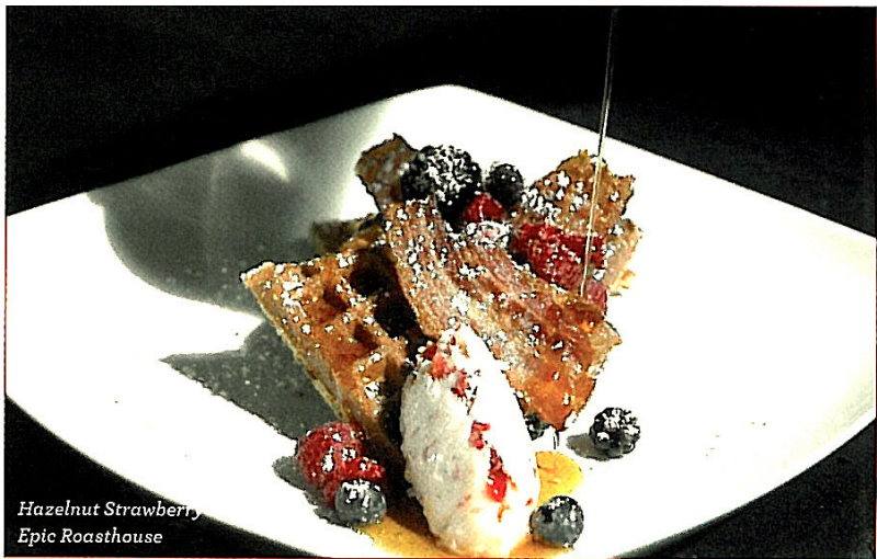
Hazelnut Strawberry Epic Roasthouse

369 The Embarcadero, San Francisco 415.369.9955 | epicroasthouse.com