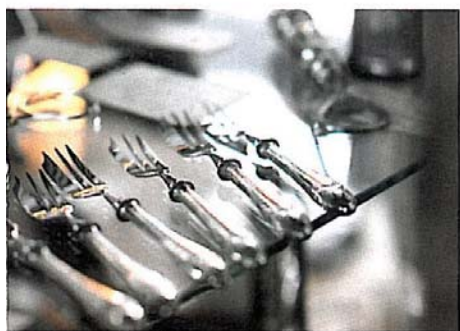
Heritage sells vintage finds like silver crab forks and a piggy-bank knife block.